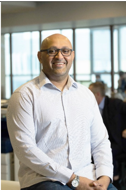
Size: 3456 x 5184 (100 dpi)