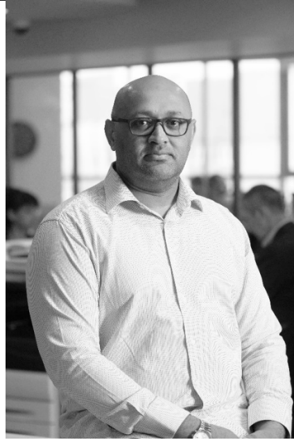
Size: 3456 x 5184 (100 dpi) Original File Attached Separately