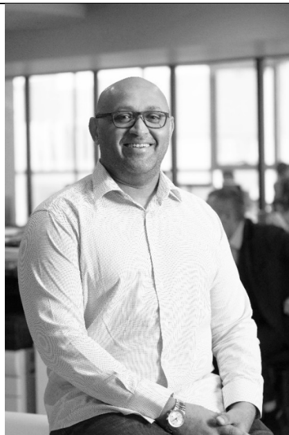
Size: 3456 x 5184 (100 dpi)