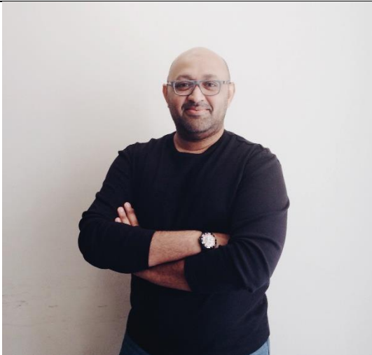
Size: 2448 x 2339 (72 dpi) Original File Attached Separately