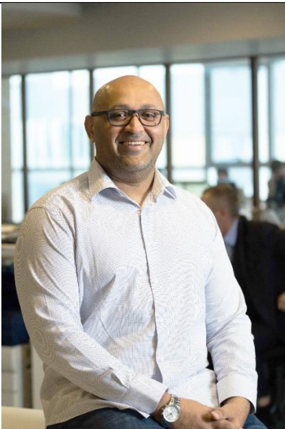
Size: 3456 x 5184 (100 dpi) Original File Attached Separately