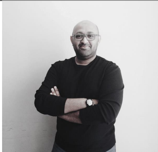
Size: 2448 x 2339 (72 dpi) Original File Attached Separately