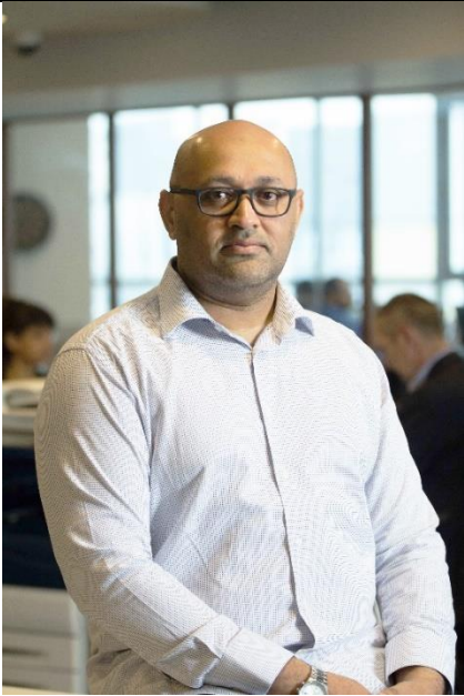
Size: 3456 x 5184 (100 dpi) Original File Attached Separately