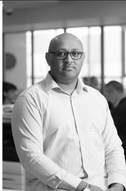
Size: 800x1200 Original File Attached Separately